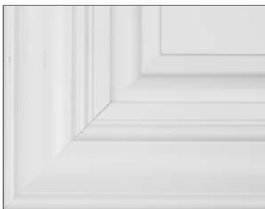
Example of front joint separation

Seam lines and hairline cracking at stile, rail and panel joints are a normal characteristic of painted finishes and should not be considered a reason for product replacement. When ordering Painted 5-piece styles, the door's center panel will be constructed of MDF material. Over time, there may be a slight color shift in the Painted finish due to the continued exposure to natural and artificial light sources. We mention these characteristics because neither Signature nor your Signature dealer can be responsible for these conditions and variations.