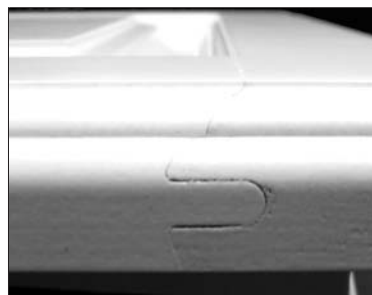
Example of end joint separation

Accordingly, we ask that the following agreement be signed for Painted Finish orders.