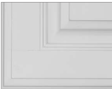
Example of front joint separation